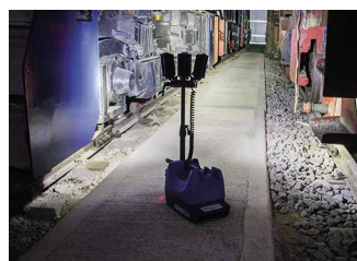
180° Directional Light